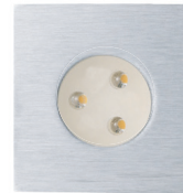
Model shown: LTDSCS3