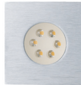
Model shown: LTDSCS6