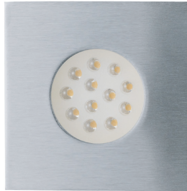
Model shown: LTDSCM12

Wiring: 240V to the transformer, low voltage to the fitting. If more than one item is wired they must be connected in parallel