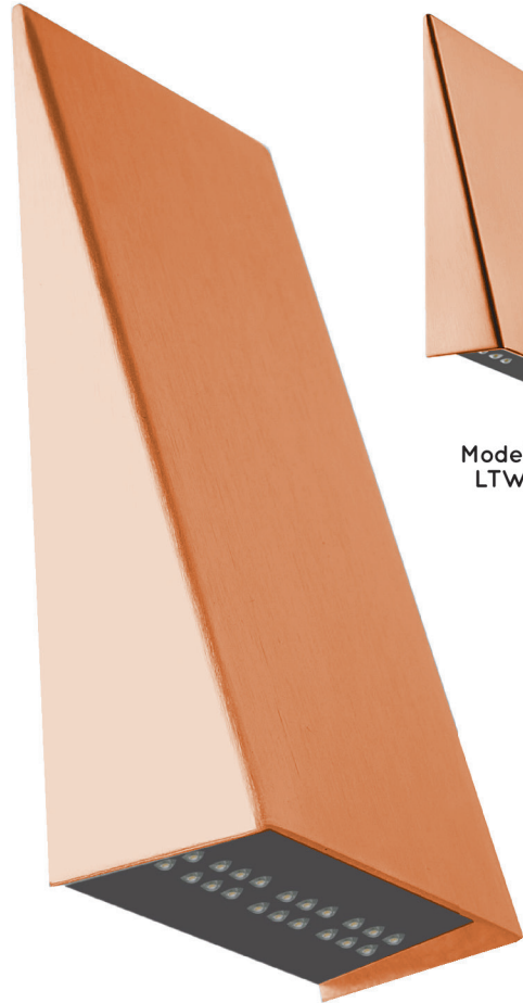
Model shown: LTWW200