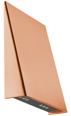
Model shown: LTWW100